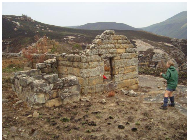
Farm house ruin