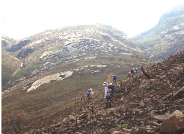
Descending path to Injesuthi Camp