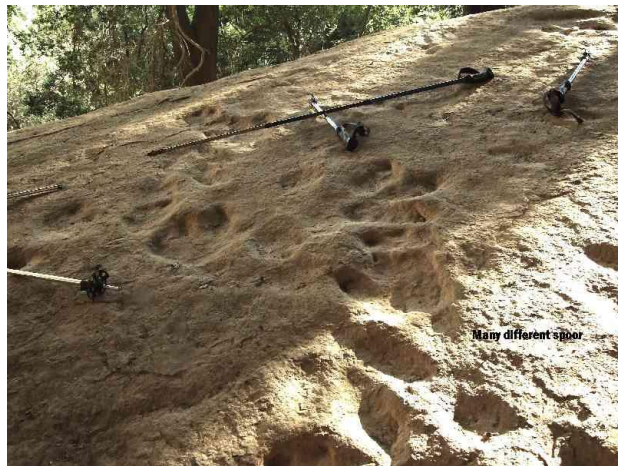
Some of the fossilized dinosaur footprints

Near the cave we found the ruins of a house & kraal walls made from stone blocks as well as a trough cut into the rock, which must have been used for dipping animals. One wonders what had attracted this pioneer farmer who had once tried to make a living in this harsh environment.