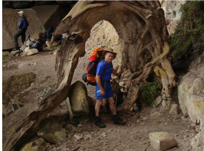
Natural arch in Dinosaur Cave

While on route, detours were made to Fergies Cave, where San rock art was viewed and then later, Dead Dog Cave, an amazing feature consisting of a series of rock overhangs at two different levels.