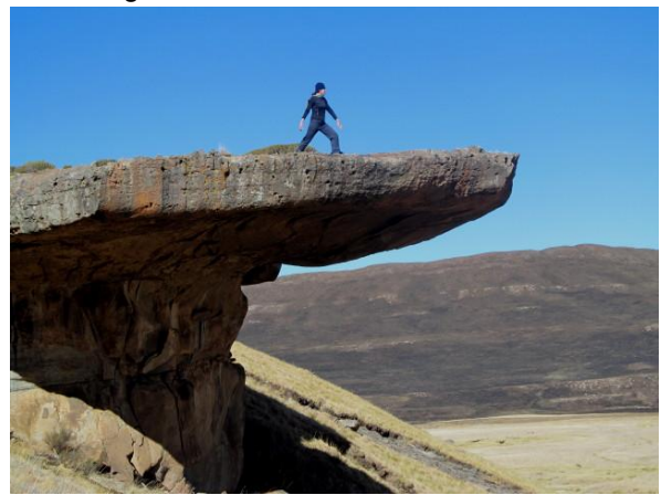
One of the many rock features near the lodge