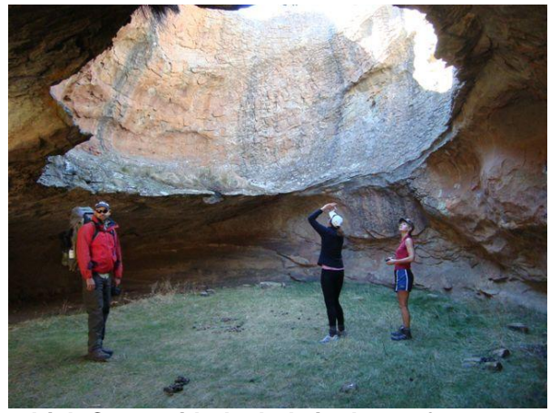
Irish Cave, with the hole in the roof

Be self confident when out hiking, prepared for what you may find and experience on the trail. Never feel out of your depth, and be able to share with other walkers from a basis of good solid knowledge and skills. Prepare for your next hike in your own time with online training by qualified Guides and MIA's (Mountaineering Instructors) www.trail-smart.com