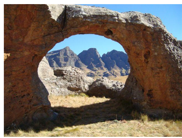
The Devil's Knuckles, viewed through a rock arch

What an awesome 3 day hike! I can honestly say that this was one of the best hikes that I've done with the Mountain Backpackers Club/Midlands Hiking Club to date.